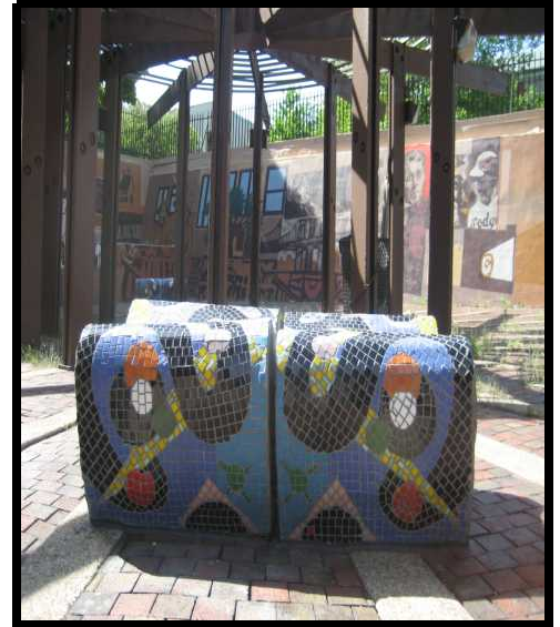
"Timeless Rhythm," Mosaic benches, Hugh Gilroy Senior Center