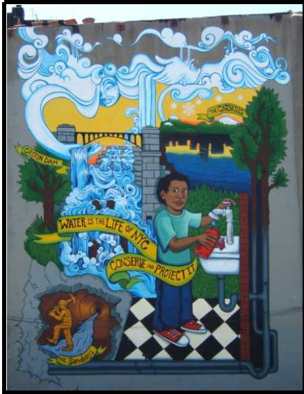
"Water is the Life of NYC" Sackett & 4th Ave, Brooklyn

Groundswell is a nationally recognized NYC non-profit that engages youth to create professional quality public art pertinent to their community. Groundswell programs foster collaboration, critical thinking and using creativity as a social tool.